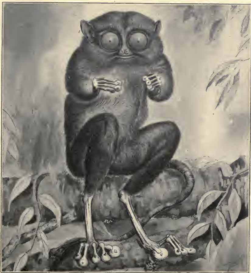
FIG. LXXIX. TARSIVS TARSIVS. WOOLLY TARSIER.

1. Adult — P. Borneo. Ward's Nat. Scien. Establ., Rochester, N. Y.